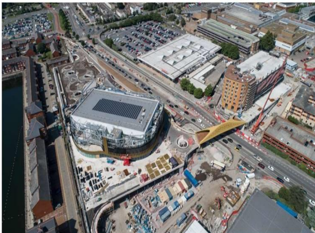
Arena - from the East

Change request submitted and approved by joint committee.