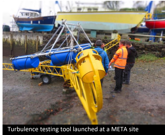
Turbulence testing tool launched at a META site